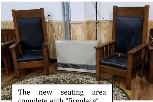
The new seating area complete with "fireplace"