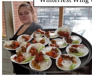
Winterfest Wing Walk